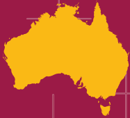
Deakin University, Melbourne, Australia

The Faculty of Business and Leadership is affiliated with the international universities listed below.