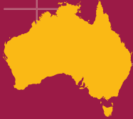
University of La Trobe, Victoria, Australia