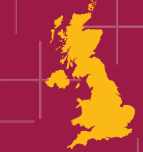
Teesside University, UK