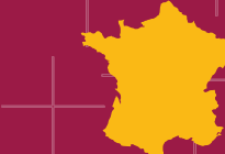
IMT Mines Albi, France