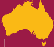
Macquarie University, Sydney, Australia