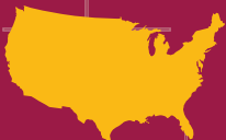
University of Wisconsin, Wisconsin, USA