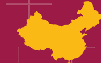
Central University, Beijing, China