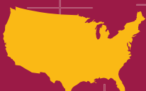
University of Kentucky, Kentucky, USA