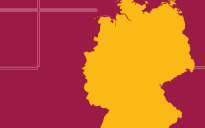
University of Aberdeen, Aberdeen Germany